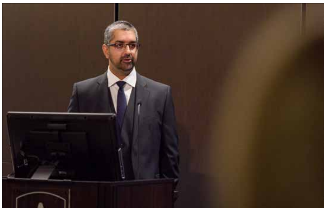
Dr. Nijjar describes the patient case to a room full of participants at Behind the Curtain 2016

The SPECT-CT is a two-in-one machine, comprising a SPECT